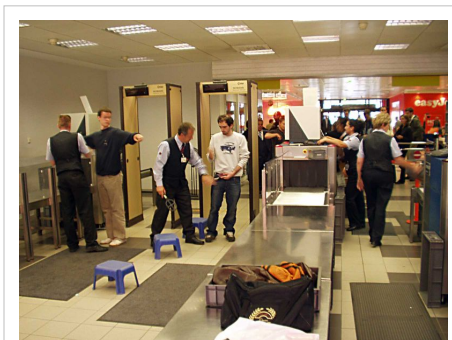
Hand-luggage inspection machine at an airport.

X-ray machines are used to screen objects non-invasively. Luggage at airports and student baggage at some schools are examined for possible weapons, including bombs. These machines are very low dose and safe to be around. The main parts of an X-ray Baggage Inspection System are the generator used to generate x-rays, the detector to detect radiation after passing through the baggage, signal processor unit (usually a PC) to process the incoming signal from the detector, and a conveyor system for moving baggage into the system.