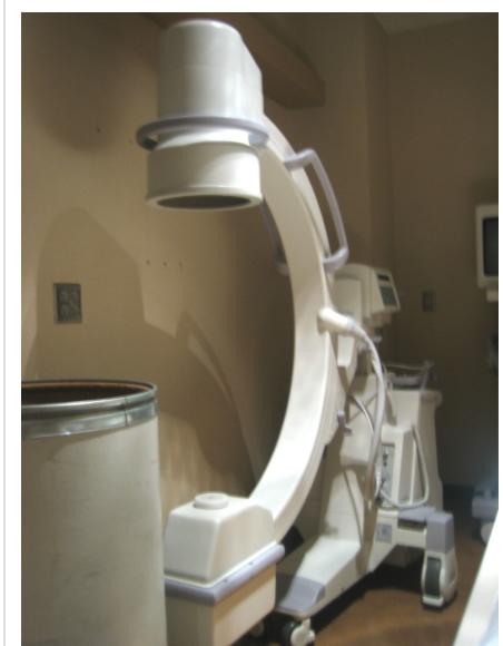
Surgical mobiles can produce images continuously.

X-rays are highly penetrating, ionizing radiation, therefore X-ray machines are used to take pictures of dense tissues such as bones and teeth. This is because bones absorb the radiation more than the less dense soft tissue. X-rays from a source pass through the body and onto a photographic cassette. Areas where radiation is absorbed show up as lighter shades of grey (closer to white). This can be used to diagnose broken or fractured bones. In fluoroscopy, imaging of the digestive tract is done with the help of a radiocontrast agent such as barium sulfate, which is opaque to X-rays.