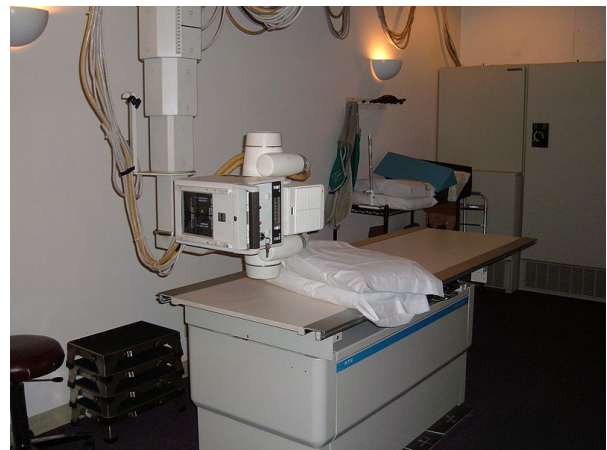
A Radiology room table. The X-ray housing is turned by 90° for a chest radiography on the wall bucky.