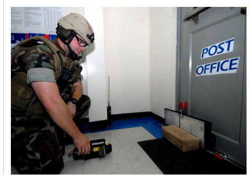
XRI50 - Portable pulsed X-ray Battery Powered X-ray Generator used in Security.

Images taken with such devices are known as X-ray photographs or radiographs.